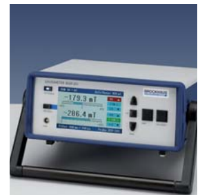
Gaussmeter BGM 201

Measuring Technology for Soft Magnetic Materials Magnetizing Technology Services