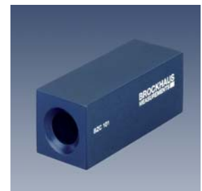
Zero field chamber BZC 101