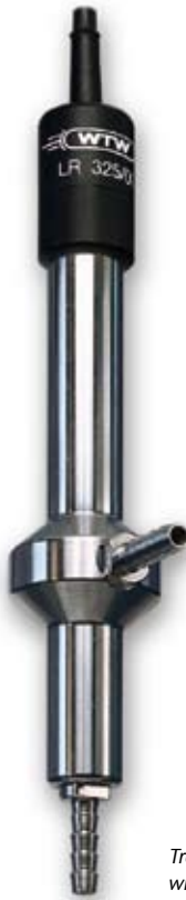
Trace conductivity cell LR 325/001 with stainless steel flow-through vessel