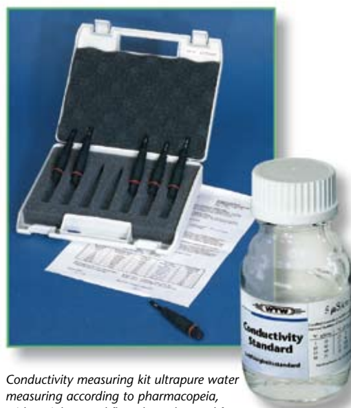
Conductivity measuring kit ultrapure water measuring according to pharmacopeia, with stainless steel flow-through vessel for pharmaceutical water.

Shelf life 1 year, NIST traceable with accuracy \pm 2\%