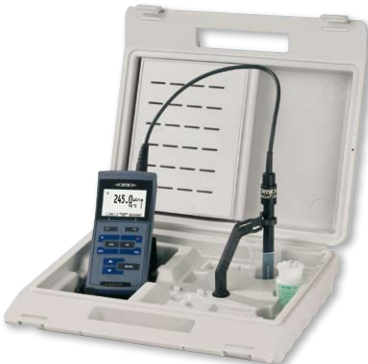
Complete as SET