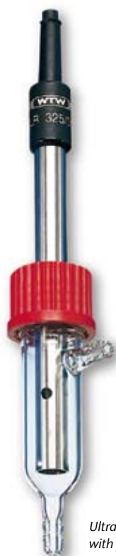
Ultrapure water cell LR 325/01 with glass flow-through vessel

This kit contains LR 325/01 Ultrapure water cell, D01/T flow-through vessel made of glass (USP-KIT 1) or stainless steel (USP-KIT 2), NIST traceable 5 \mu\text{S} standard with accuracy \pm 2\% and 6R/SET/LabTesting set