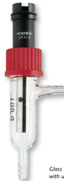
Glass flow-through vessel D01/T with ultrapure water cell LR 01 V