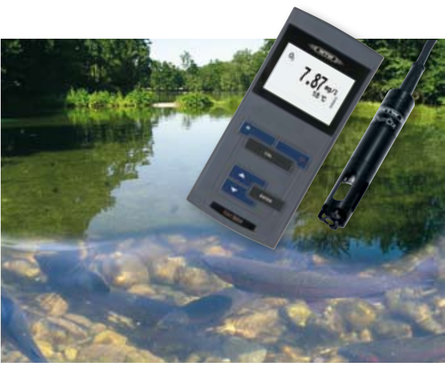
D.O. measurement with ProfiLine Oxi 3205 and DurOx® incl. protection cap in fish farming