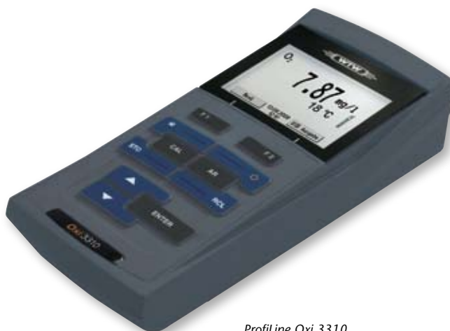
ProfiLine Oxi 3310

The Oxi 3210 is a portable first class dissolved oxygen meter with intuitive, user-friendly interface. Measured values are displayed as concentration, saturation or partial pressure, individual values can also be manually saved and displayed on the screen.